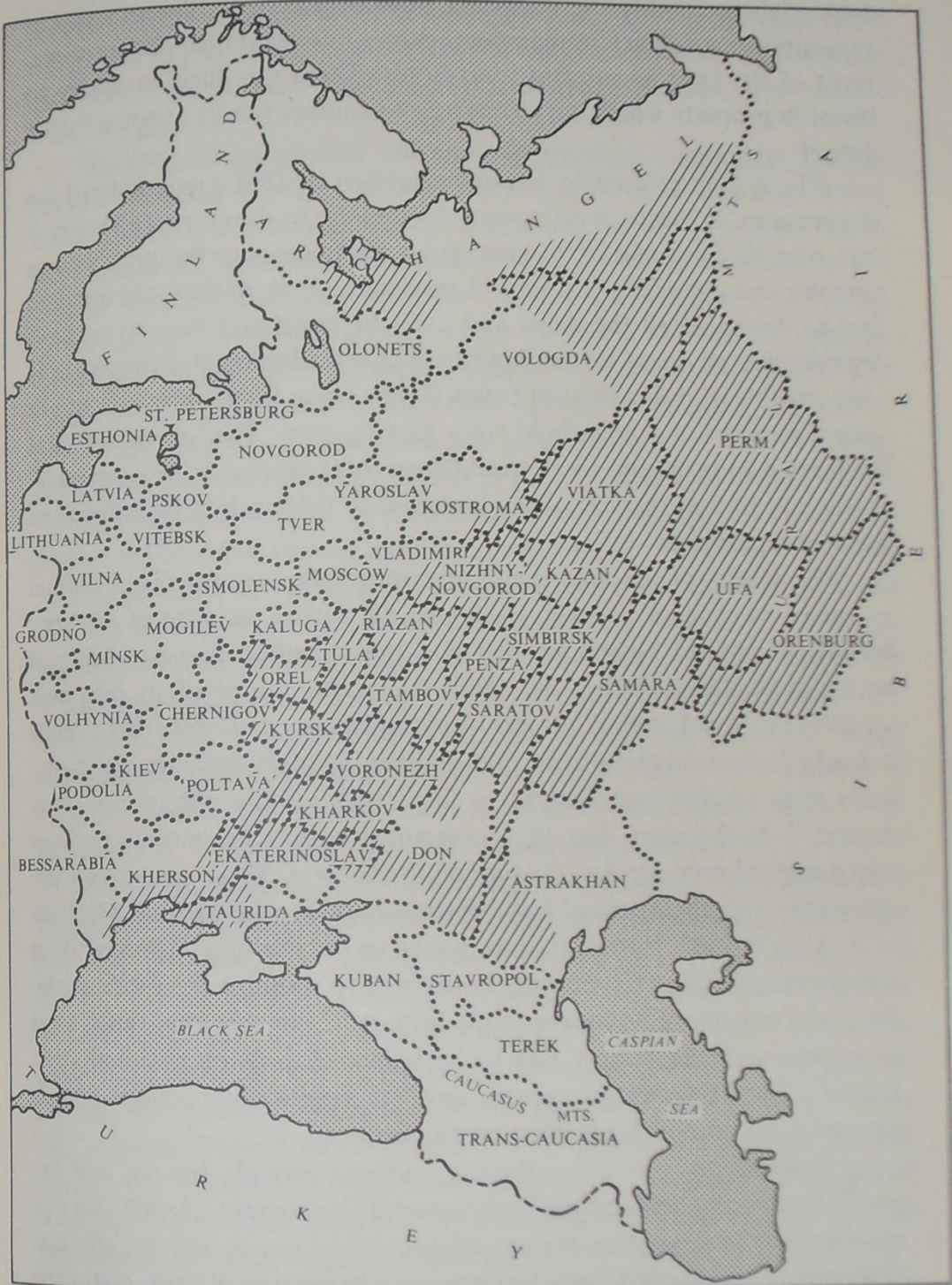
EUROPEAN RUSSIA, SHOWING AREAS OF POOR HARVEST IN 1891